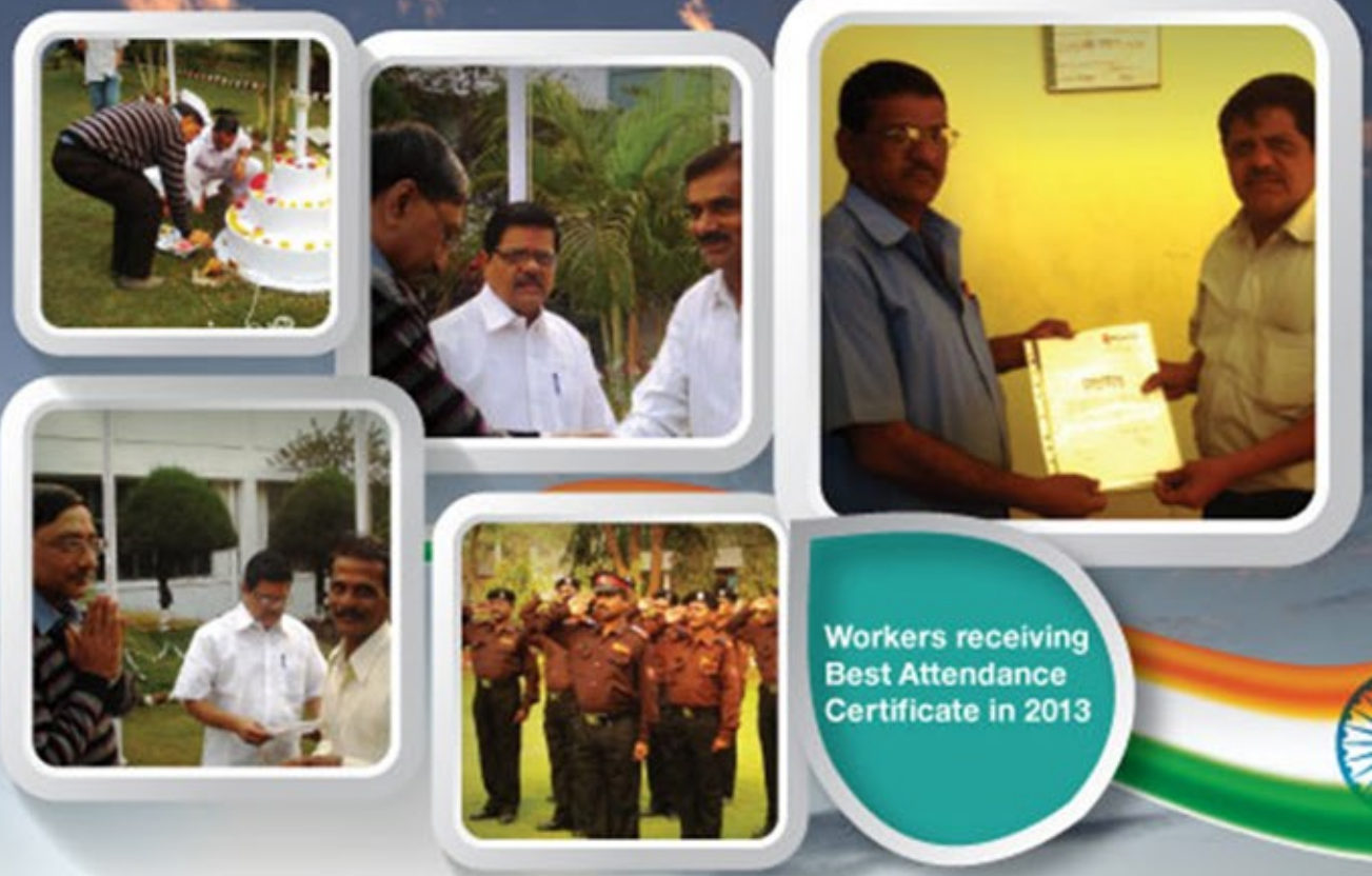
Workers receiving Best Attendance Certificate in 2013