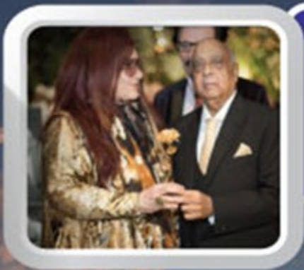
Mrs. Shahnaz Hussain, CMD Shahnaz Hussain Group